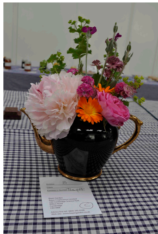
Entries for flower arrangement in a teapot.