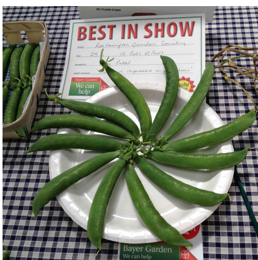
Raj Patel's Peas - 'Best in Show'

Well done to both Pat & Raj who took several prizes each.