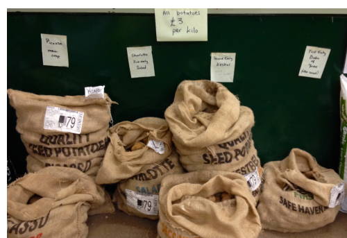
Seed Potatoes on Sale