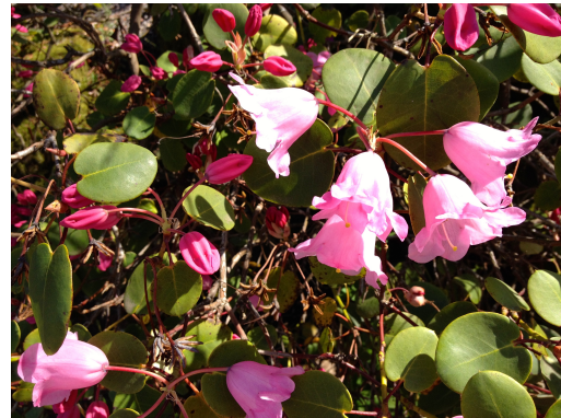
Pink bell-shaped rhododendron