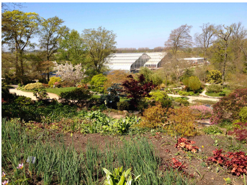
Greenhouses at Wisley

12 of us went to Wisley and were taken on a garden tour.