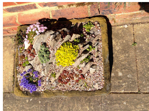
Sand & rock garden