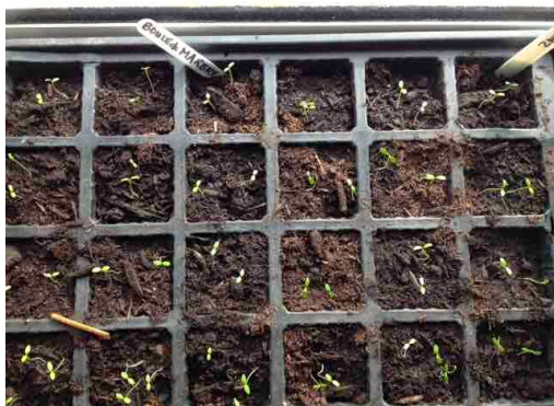
Celeriac Boule de Marbre and Prinz 15 days after sowing in new Wool compost available from the store.

Georgina says' "I used the Wool Seed Compost for small seeds such as chillies, tomatoes, aubergines and celeriac. The germination was as near 100% as I could tell. The seeds all flourished and grew at a good rate. The compost is friable to handle, is free draining and does not harden up when wet. Yes, it is expensive, but to give small seeds a good start I think it is worth the money."