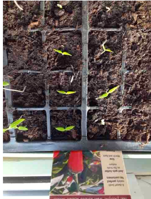
Chilli Apache 16 days after sowing in new Wool compost available from the store.