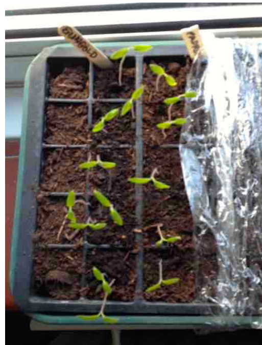
Tomato Sungold 13 days after sowing in new Wool compost available in the store