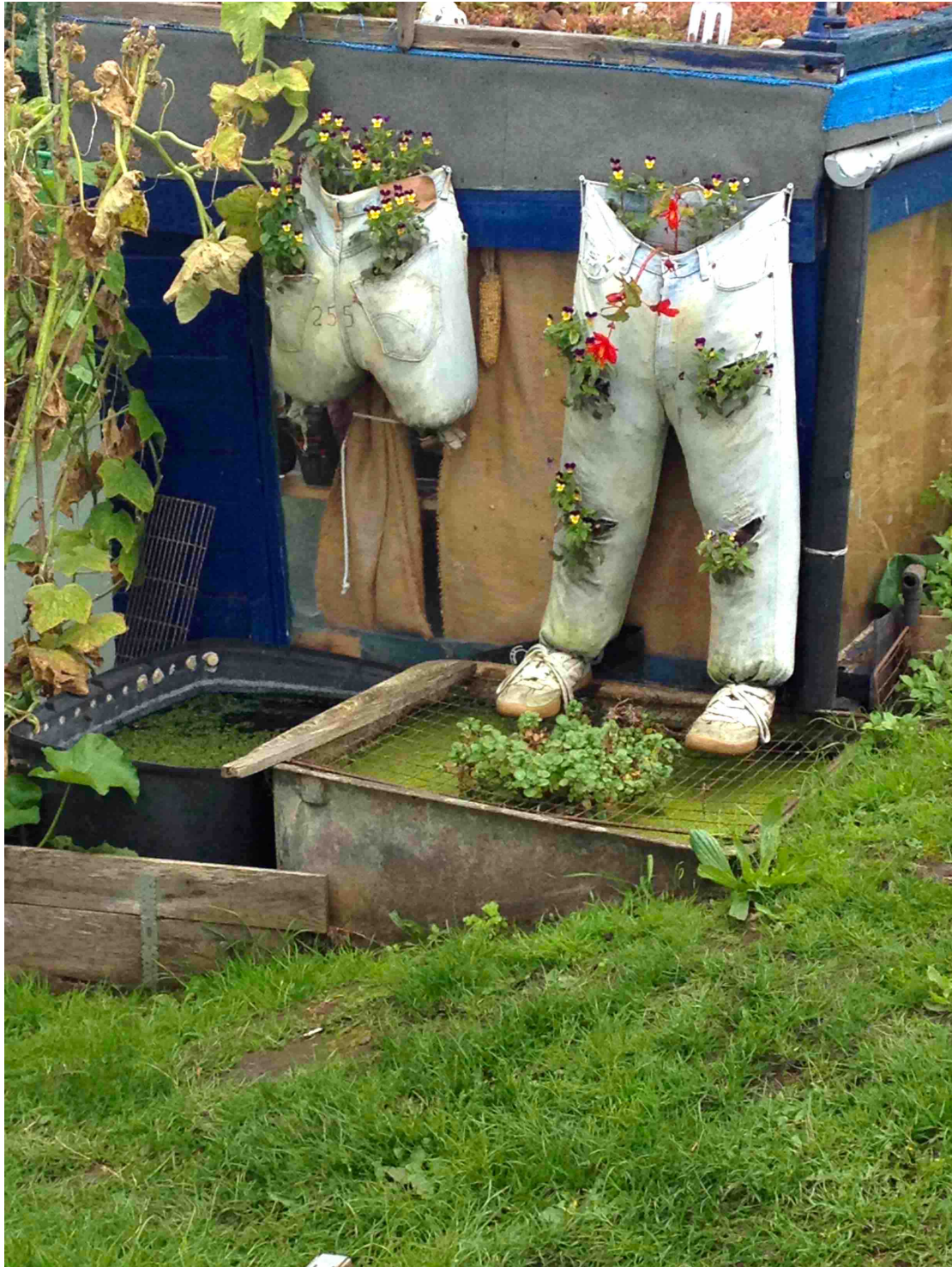
How to recycle those old jeans - seen at Fulham Palace Allotments – thanks to Georgina O'Reilly!

PLOT INSPECTIONS: Expect to see at this time of year - Plots that have been tidied up for the winter, Weeds being under control and not likely to invade any neighbouring plots, That surrounding paths are nor obstructed and are well maintained.