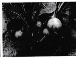
Radish 22 days