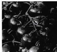
Tomato - bush (Red Alert)