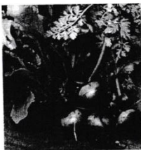
Beetroot 56 days