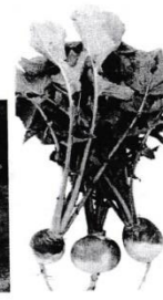
Turnips 60 days