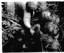
Carrots 70 days