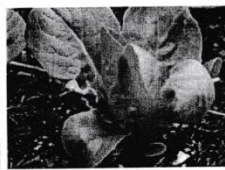
Lettuce 45 days