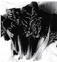
Swiss Chard (Rainbow Chard)