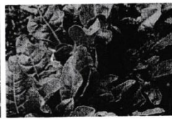
Spinach 77 days