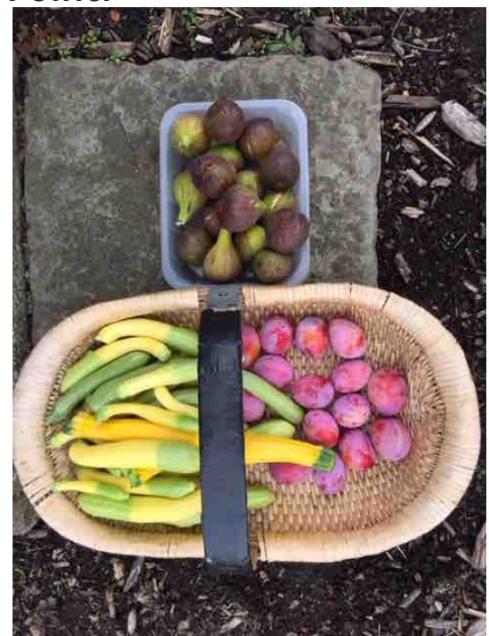
The Linton's produce