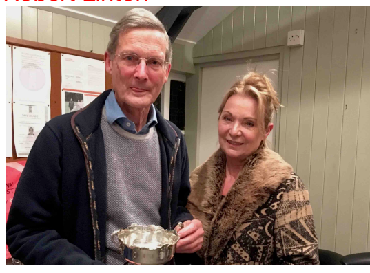
The Dr Howard Coulthard Cup – The best bowl of roses arranged for an all round effect