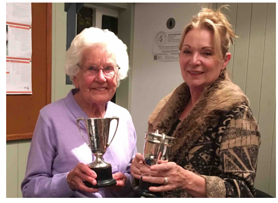
The Lady Corry Cup The best vase of multiflora roses