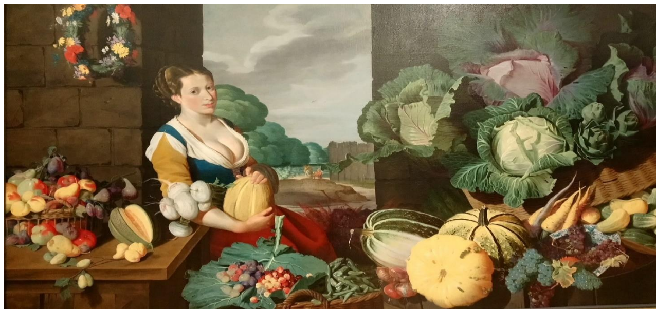
Cookmaid with still-life of Vegetables and Fruit, Nathaniel Bacon 1620.

When we saw this at Tate Britain my daughter said, “oh look Mum, it’s you when you come back from the allotment”. I wish.