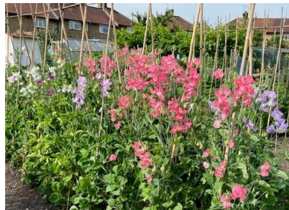
Rob's sweet peas growing on Site 3.